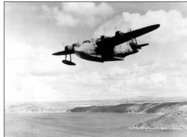
A Short Sunderland flying boat from RAF Mount Batten showing its graceful form flying across the Mew Stone, near Wembury, South Devon.