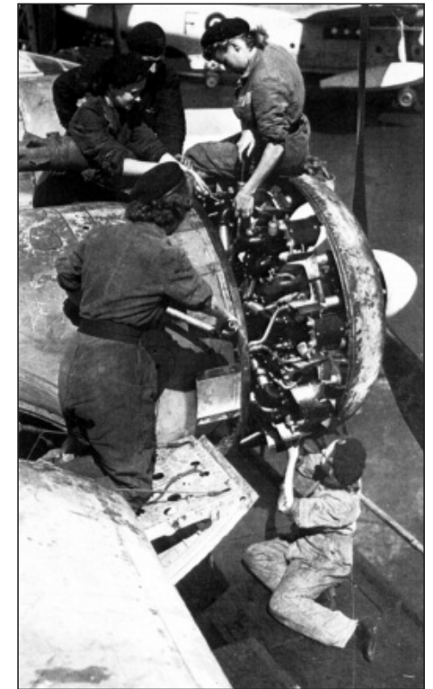
Below: WAAF engine flight mechanics supervised by an NCO fitter servicing a starboard engine at RAF Mount Batten, 1943.